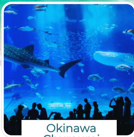
Okinawa Churaumi Aquarium